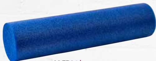
LLFR24 | Blue 24" x 6"