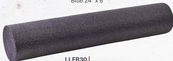
LLFR30 | Black 30" x 6"