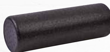
LLPFR18 | 18" x 6"