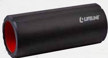
LLPGR13 | 13" x 5.5"